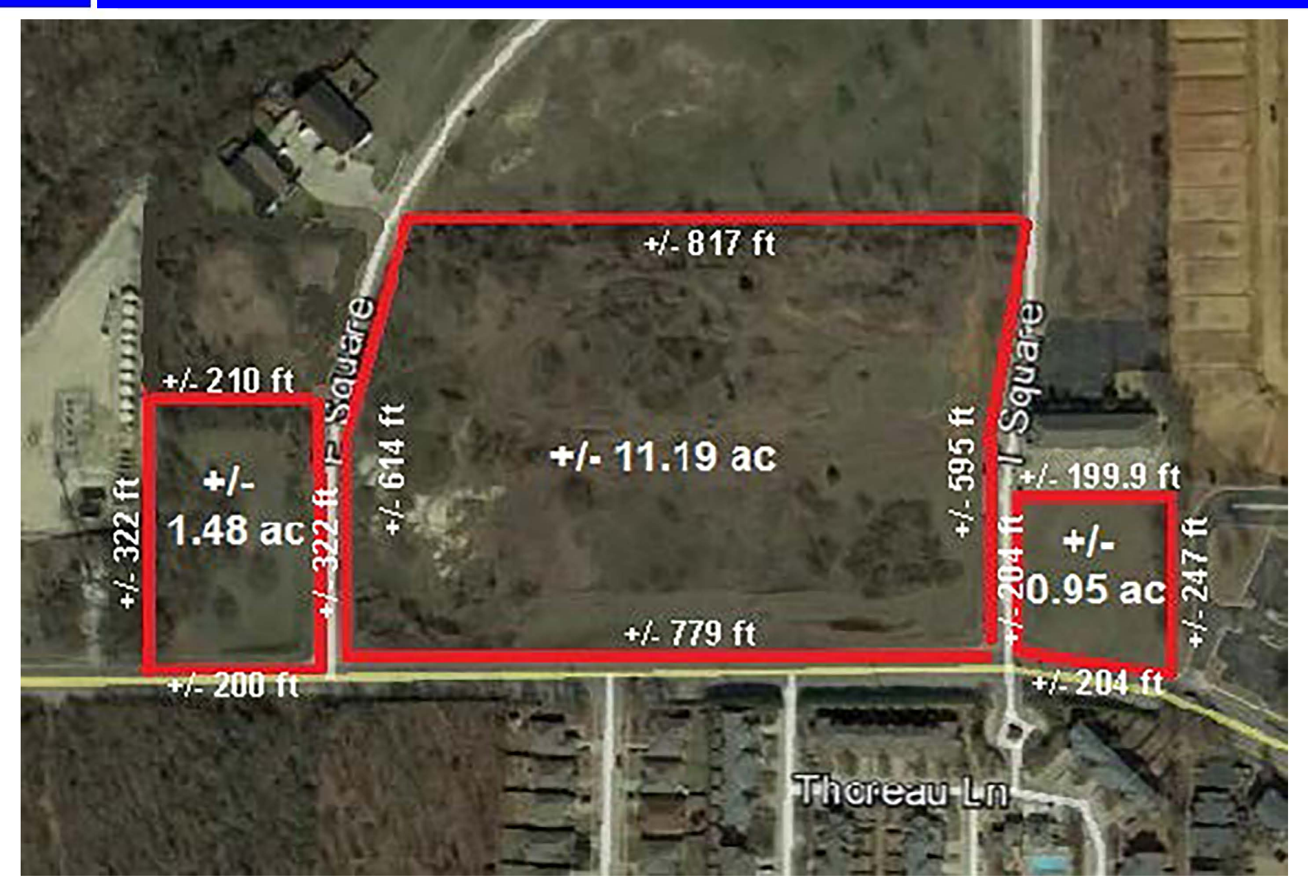
© 2016Whitten Commercial Realty LLC. We obtained the information above from sources we believe to be reliable. However,we have not verified its accuracy and make no guarantee, warranty or representation about it. It is submitted subject to the possibility of errors, omissions, change of price, rental or other conditions, prior sale, lease or financing, or withdrawal without notice. We include projections, opinions, assumptions or estimates for example only, and they may not represent current or future performance of the property. You and your tax and legal advisors should conduct your own investigation of the property and transaction.